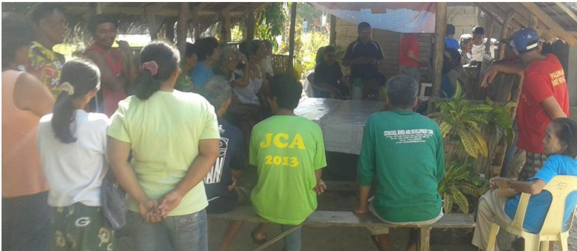
Consultation with displaced Bugsuk residents at Barangay Calasaguen, Brooke's Point, Palawan, March 20, 2014.

SAMBILOG members with their orange-and-red banner posed with Team PAKISAMA after the consultation held at Barangay Sebaring, Bugsuk Island, Balabac, Palawan on March 19, 2014.