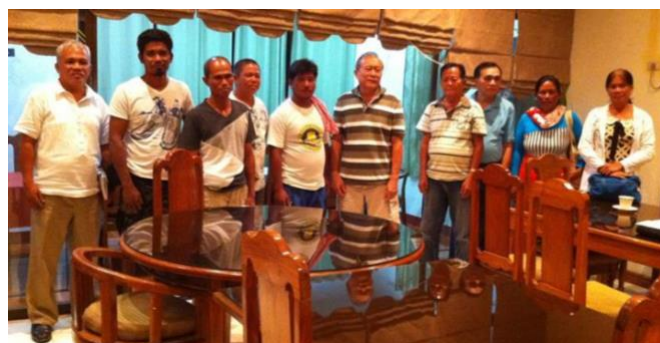
Photo above shows PAKISAMA's SAMBILOG leaders seeking the help of DILG Undersecretary (USec) Bimbo Fernandez (at the center, above) at the DILG central Office in Quezon City last March 28, 2014 vs. the Balabac mayor's use of policemen to harass