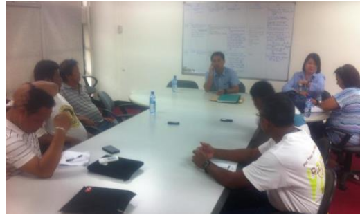
DAR's Palawan P.ARO discussing to-do's with PAKISAMA staff and SAMBILOG leaders

(e.g., in Matangule and Marihangin islands), the rest scattered in the municipalities of Bataraza and Brooke's Point, and Puerto Princesa City (Palawan's provincial capital). Amid harassments/threats made by Cojuangco's goons on PAKISAMA personnel, the latter collected affidavits from the 750+ former Bugsuk-Pandanan residents or their offsprings who narrated their experience/trauma from Mr. Cojuangco's ejection of them/their parents back in 1974. The affidavits were submitted to DAR by end-May for validation by DAR personnel (even as more former Bugsuk-Pandanan residents in other parts of Palawan came forward to likewise tell their stories of being driven out/dispossessed of their Bugsuk/Pandanan lands by Mr. Cojuangco).