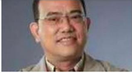
Agrarian Reform Secretary Virgilio de los Reyes: 'Misfit'.

MANILA, Philippines—Five months before the June 14, 2014, deadline for the distribution of agrarian reform lands, nine Catholic bishops have appealed to President Aquino to fire Agrarian Reform Secretary Virgilio de los Reyes and fast-track the distribution of land to farmers.